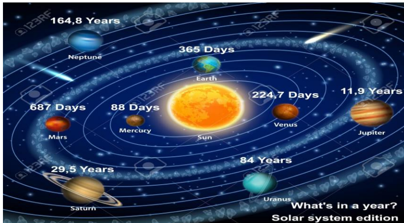
Solar System Diagram

18 For thus saith the LORD that created the heavens; God himself that formed the earth and made it ; he hath established it, he created it not in vain, he formed it to be inhabited : I am the LORD; and there is none else.