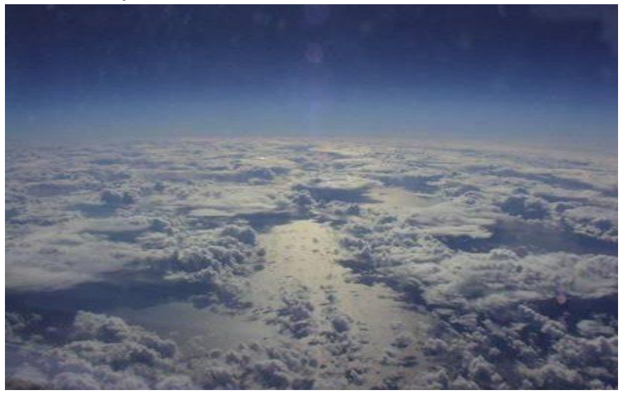
Minister's Comments: The Curvature of the Earth

- signs in the earth:- The Concorde used to reach up to 60,000 ft, a height of over 11 miles. So passengers were able to see curvature of the Earth